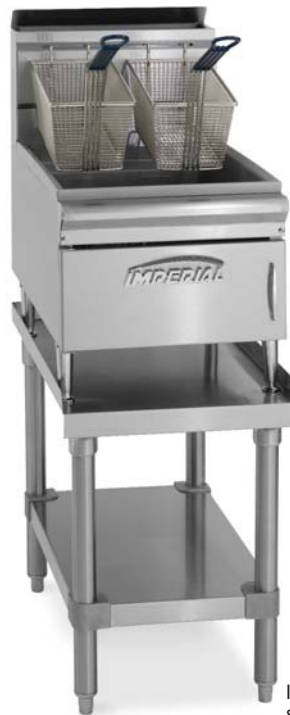
IFST-25 shown with optional stainless steel equipment stand

Robotic welding is precise, virtually eliminating leaks.