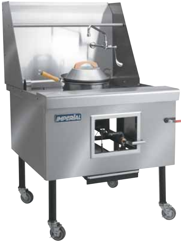
Model ICRA-1 shown with optional front drain, casters stainless steel top and sides