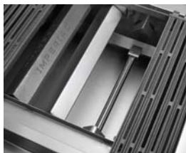
Stainless steel burners with both cast-iron and optional stainless steel radiants shown.