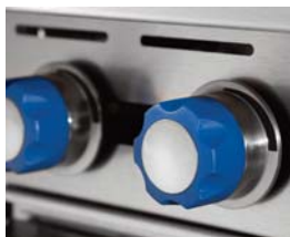
Durable cast aluminum with a Valox™ heat protection grip.